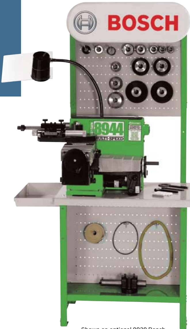
Shown on optional 8939 Bench with 8010 adapter group