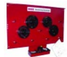
Pin Plate System

plus ensure the mounting accuracy that leads to correct balancing every time. Coats adapters are available to fit almost every wheel. This is a dynamic process, and we will continue to innovate to keep pace with the marketplace.