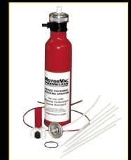
INTAKE CLEANING KIT Part No. 200-8667