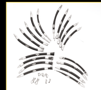
DELUXE KIT Part No. 200-3026