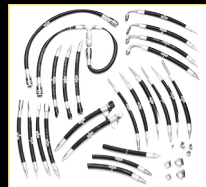
STANDARD KIT Part No. 200-3025